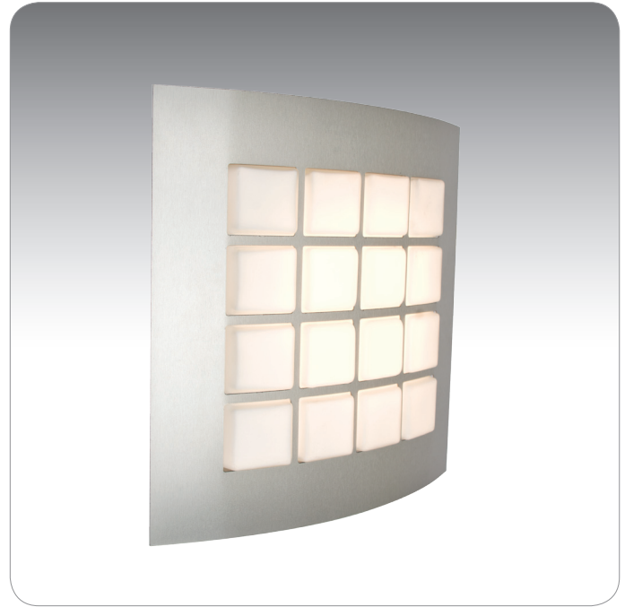
OPAL/ BLACK (QUAD10) & OPAL/SILVER (QUAD13)

UL or ETL Listed. Suitable for Wet Locations (interior or exterior use).